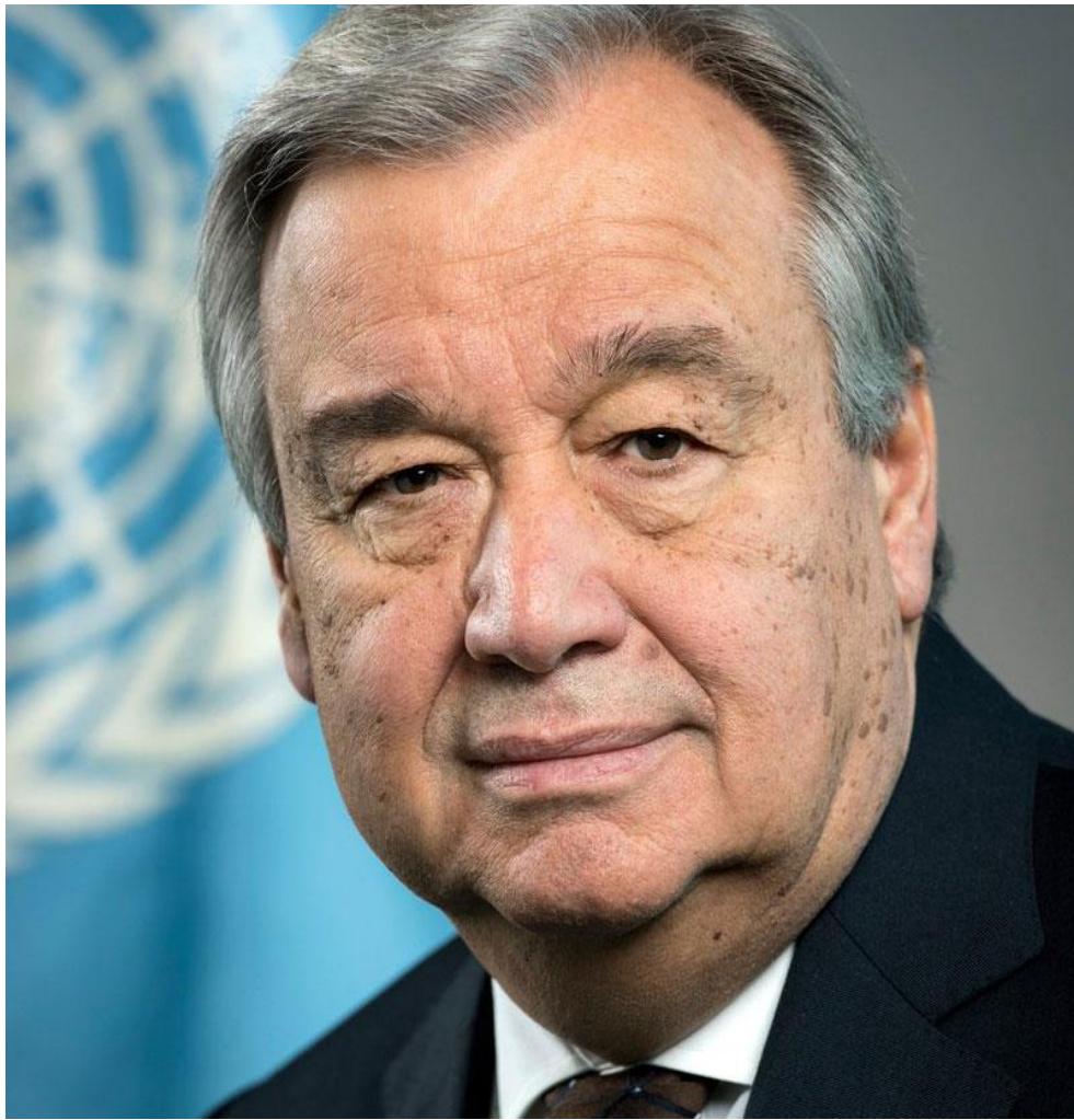
UN Secretary General António Guterres

“It is unacceptable that hunger is on the rise at a time when the world wastes more than one billion tonnes of food every year. It is time to change how we produce and consume, including to reduce greenhouse emissions. Transforming food systems is crucial for delivering all the sustainable development goals (SDGs).”